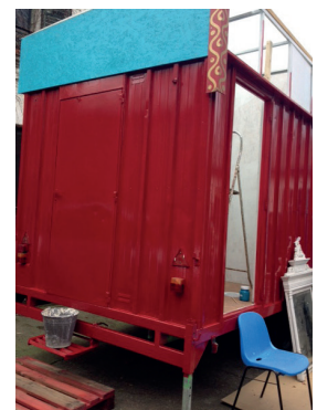
The entrance of the site with the post box (left); one of the two sanitary blocks that will soon be installed (right)